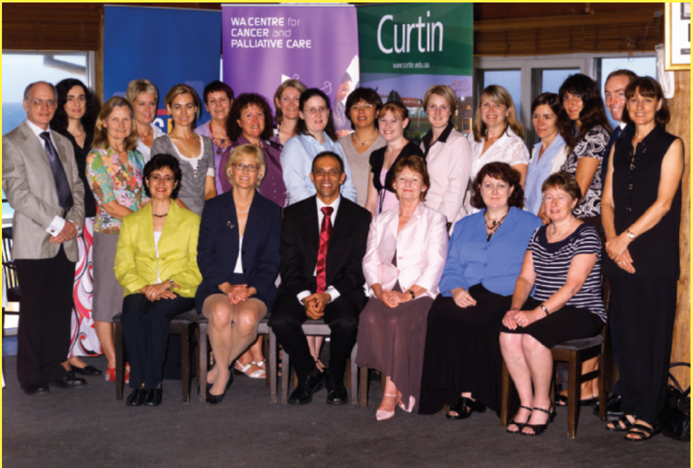
THE WACCPC TEAM